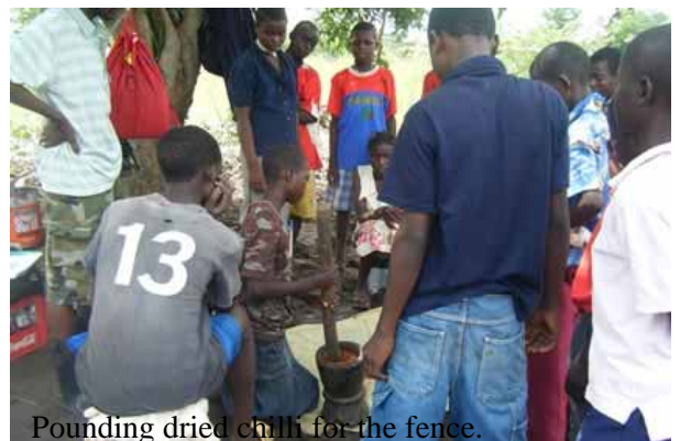
Pounding dried chilli for the fence.