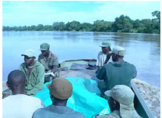
Fly camp deployments by boat.