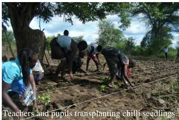
Teachers and pupils transplanting chilli seedlings.