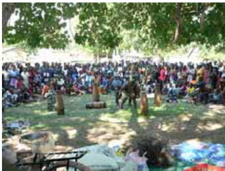
Drama group performing at the finals.

The campaign is conducted through drama by the local but internationally recognized drama group called SEKA, and also through the use of sport. This year we included netball matches for the women as well as football for the men.