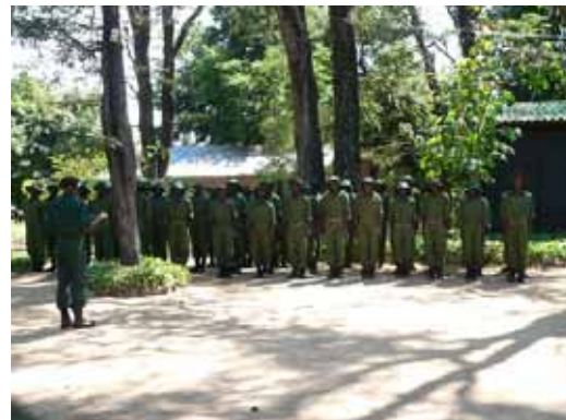
New training recruits.

The first 2008 scout training program opened on 6 th May with 59 students.